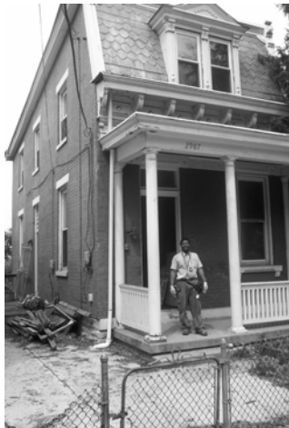
2987 W. McMicken Ave.