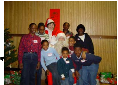
Christmas Party 2003

BREAKING NEWS... The Community Land Co-op has a new website and we are working on adding photos of our homes, information about us, links to local organizations and soon an on-line donation link. Check us out at http://www.communitylandcooperativeofcincinnati.org